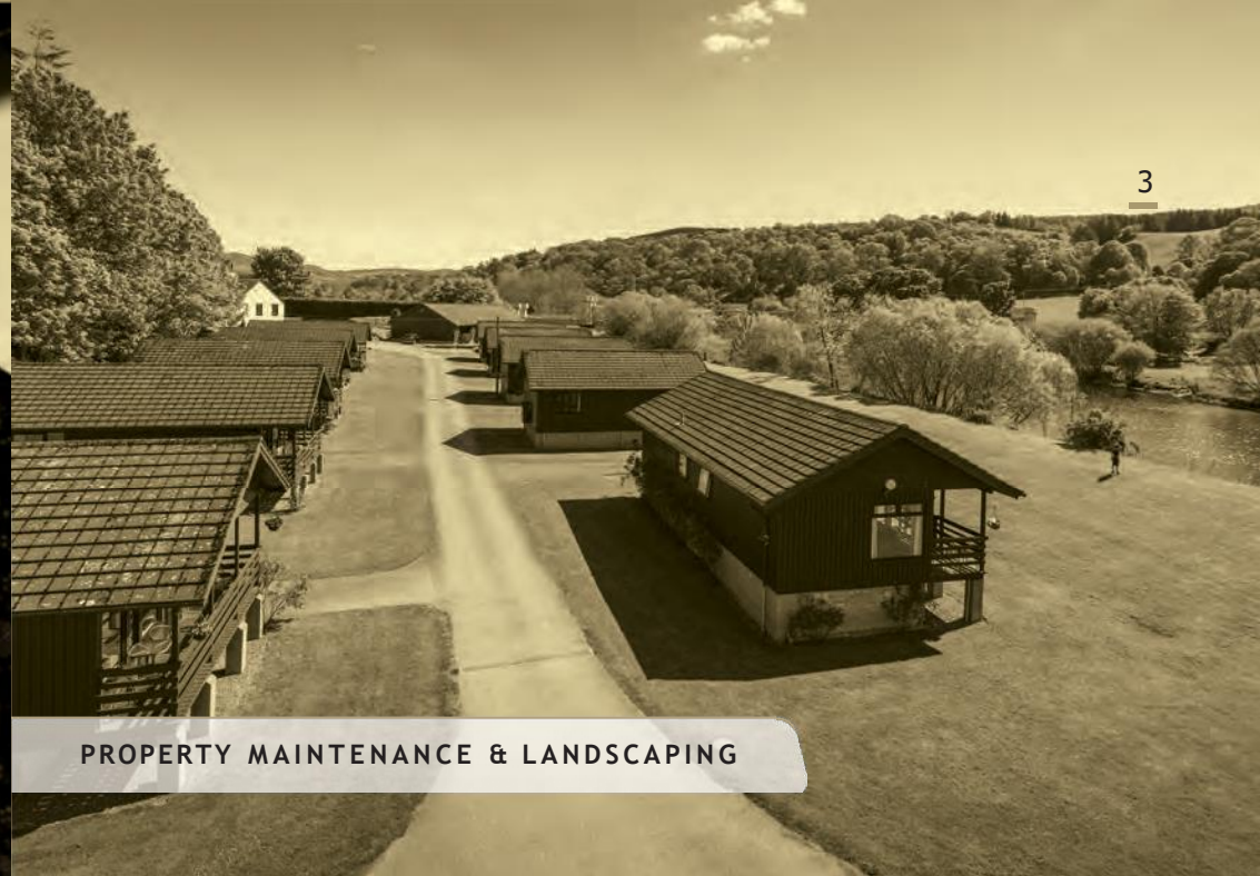
PROPERTY MAINTENANCE & LANDSCAPING