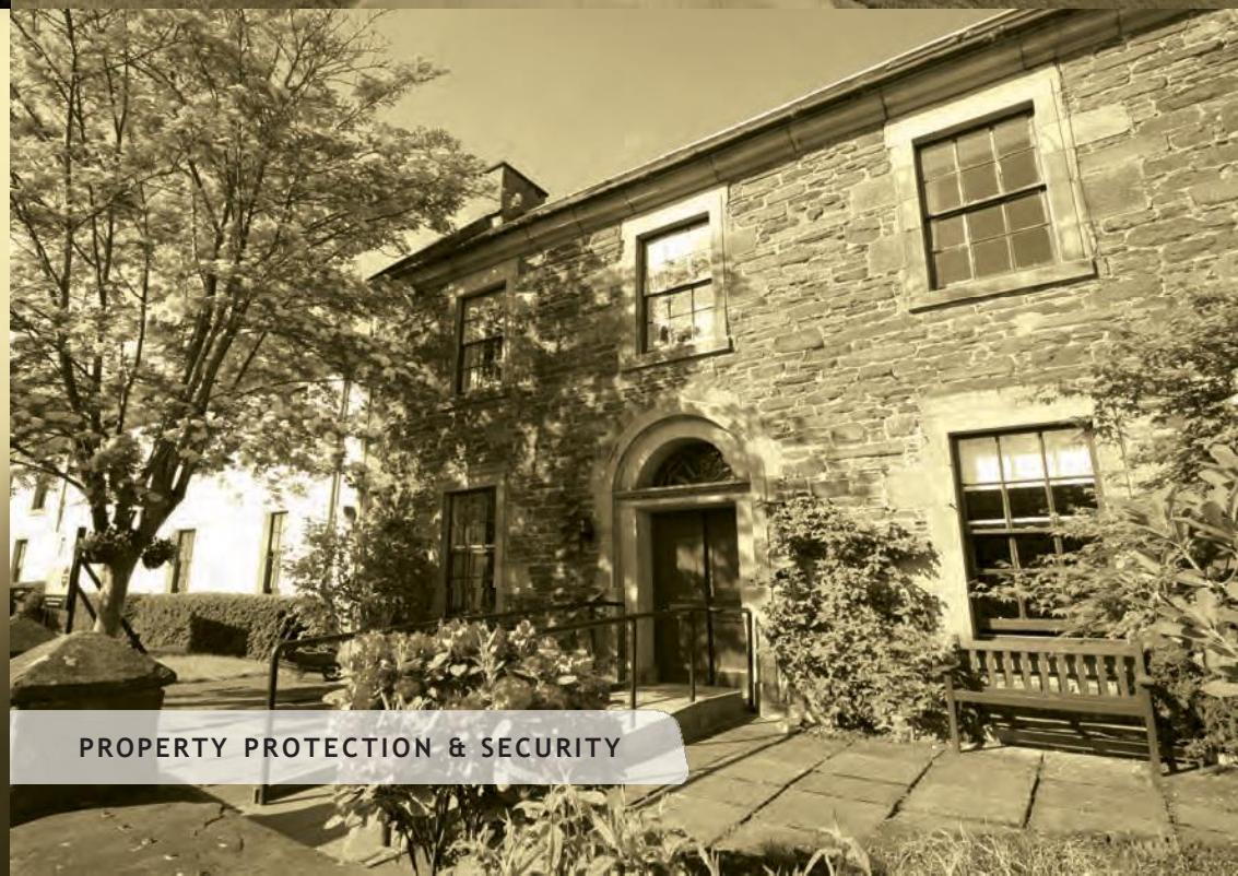
PROPERTY PROTECTION & SECURITY