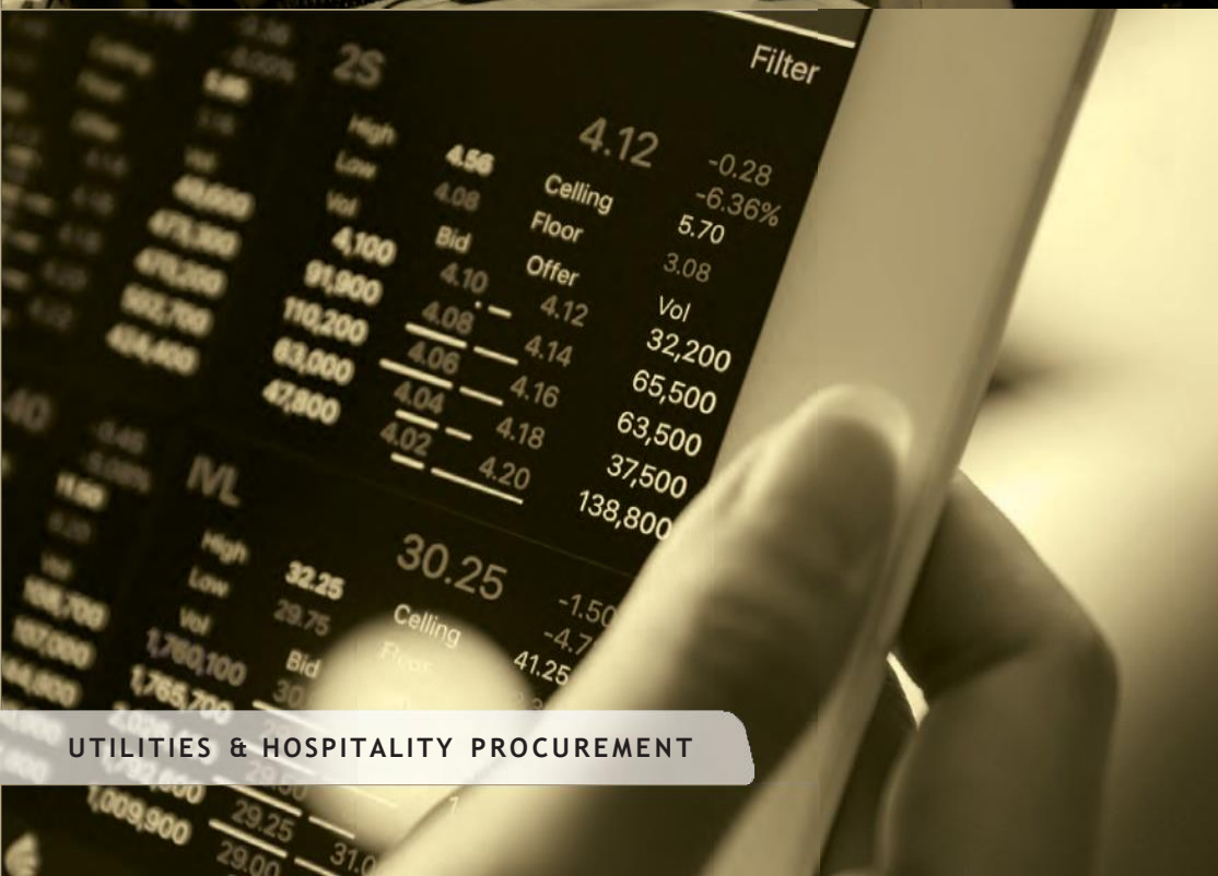
UTILITIES & HOSPITALITY PROCUREMENT