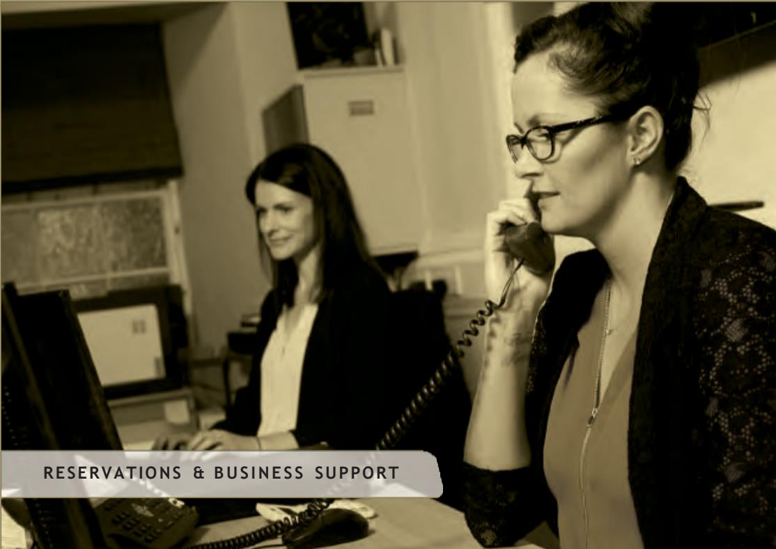
RESERVATIONS & BUSINESS SUPPORT